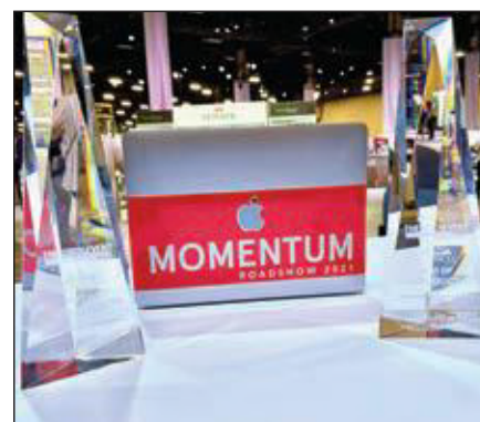
Surfaces 2021 was the final stop on Mohawk's Momentum Roadshow for 2021.

Association (WFCA), said it was a "big ringing of the bell" that we are open for business again. "Kudos to Informa for officially opening up our industry," he said.